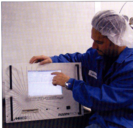
Tiger Optics's CRDS system in action: the MTO-1000 can measure moisture levels of 100 ppt.

For example, in a continuous-wave CRDS system the electronics that are required to cut off the beam are delicate and highly tuned. More importantly, the cavity-mode constraints due to the narrow linewidth of the source necessitate a precision operation to tune the cavity length to the wavelength of the laser. If the mirrors become soiled and have to be removed for cleaning, replacing them without destroying the alignment is no trivial feat, cautions Orr-Ewing.